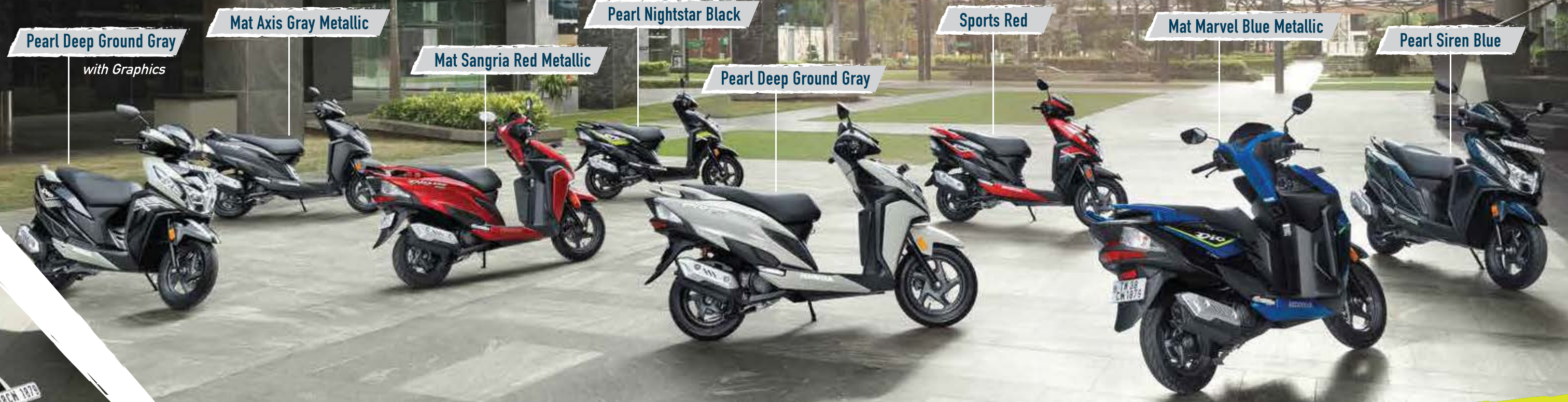
Pearl Deep Ground Gray with Graphics